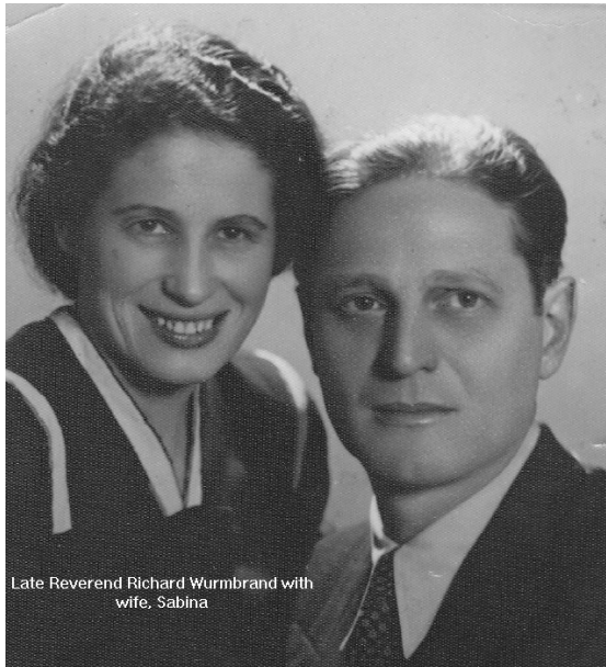
Late Reverend Richard Wurmbrand with wife, Sabina