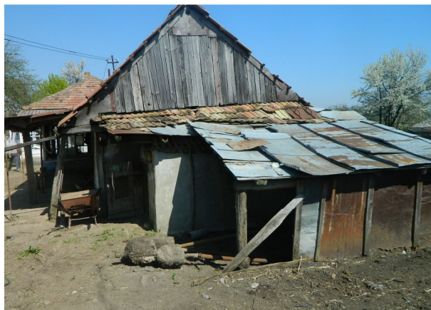
House in which orphans lived, before being received in the Agape Orphanage