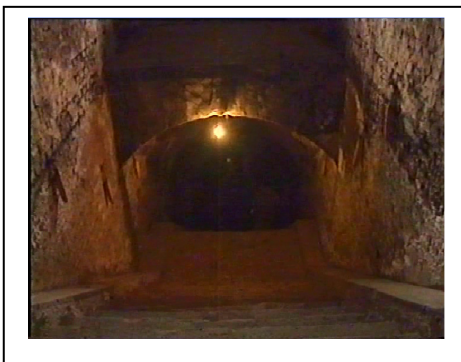
The Communist Jilava Prison. Entrance to the underground cells.

We must try to have a love similar to God's love for us. We must give away everything and not what costs us nothing. King David is quoted in the Bible as having said: "neither will I offer burnt offerings unto the Lord my God of that which doth cost me nothing." (Samuel II, 24.24). We must also be ready to give what is most precious to us. Do we value our time most ? Then, let's give much of it to doing charity work. Do we value wealth? Let us give from it to those in need!