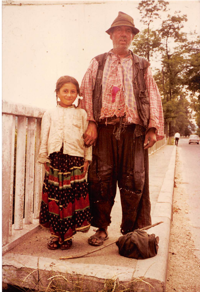
There are about 1/2 million gypsies (now called Roma) living in Romania. (stock photo)