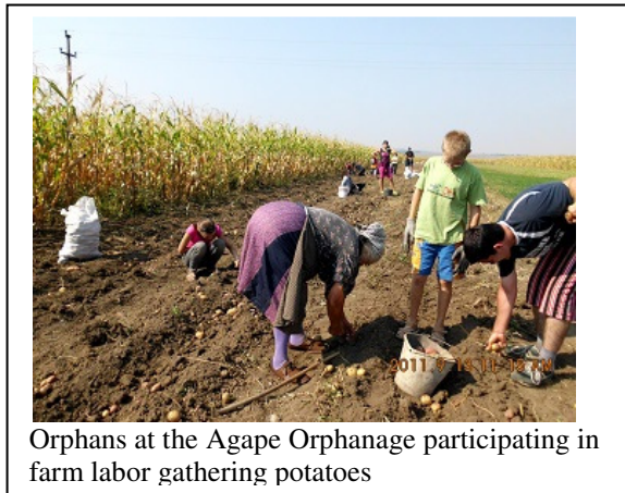
Orphans at the Agape Orphanage participating in farm labor gathering potatoes